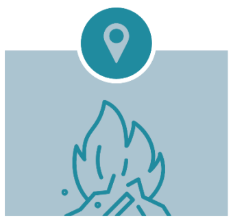
Scenario 8: Direct Combustion with Partnered Landfill