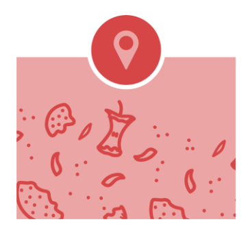
Scenario 7: AD/Organics with Partnered Landfill